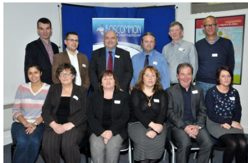
Project partners pictured at the kick off meeting in Roscommon

Led by Roscommon Leader Partnership , the Creative Communities Igniting Change project brings together partners from Northern Ireland Banbridge District Council and Canice Consulting , Sweden ( Folkuniversitetet in Skåne län ), Poland ( Northern Chamber of Commerce, Szczecin and University of Humanities and Economics, Łódź and Irish partners Momentum .