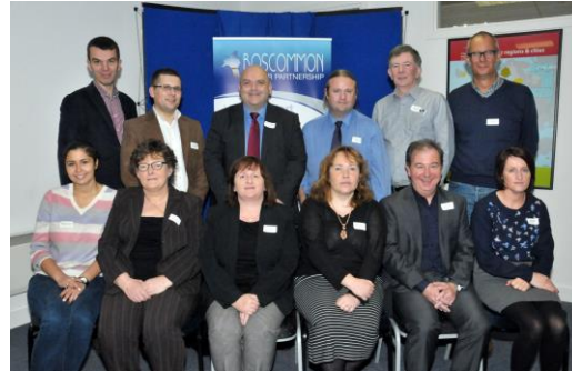
Project partners pictured at the kick off meeting in Roscommon

Led by Roscommon Leader Partnership , the Creative Communities Igniting Change project brings together partners from Northern Ireland Banbridge District Council and Canice Consulting , Sweden ( Folkuniversitetet in Skåne län ), Poland ( Northern Chamber of Commerce, Szczecin and University of Humanities and Economics, Łódź ) and Irish partners Momentum .